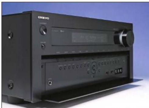
ONKYO TX-NR828 EXCLUSIVE! av receiver

FREE READER CLASSIFIED ADS IN THIS ISSUE!