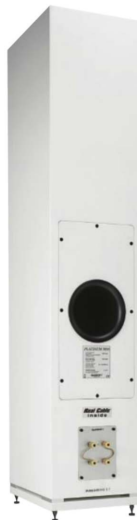
A large rear bass port provides in-room response down to 25Hz.

Bass response is also impressive. There may not be the visceral slam of a 12-inch driver but the large rear port enables the M50s to go impressively low when the music demands. The beginning of Bach's 'Passaglia in C Minor' spirals down with real power through the Quadral's until its final organ note hits you with the