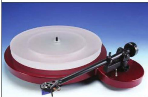
INSPIRE BLACK MAGIC Si EXCLUSIVE! turntable