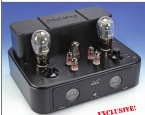
MING DA DYNASTY DUET 300B EXCLUSIVE! single ended integrated amplifier