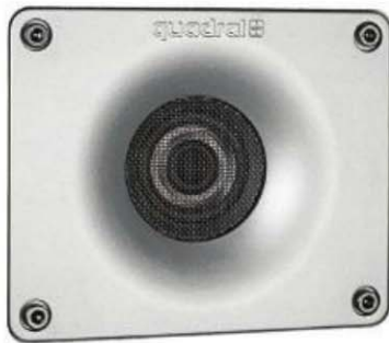
Quadral's new RiCom-V ring dome tweeter gives an exceptionally smooth and flat response.

treble, low-end power, mid-range detail or out-of-the-box imaging. Only a special few manage to put it