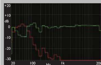
Green - driver output Red - port output